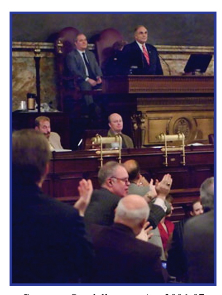
Governor Rendell presenting 2006-07 budget before General Assembly.

Governor Edward G. Rendell signed a $26.1 billion 2006-07 budget that includes $297 million in business tax cuts that will enhance Pennsylvania's competitiveness, as the state continues efforts to attract private-sector investment and new jobs while rebuilding the economy.