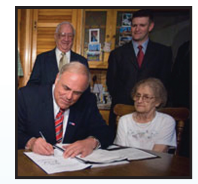
Governor Rendell signs SS HB 39 into law at the home of Nellie Hughes, June 27.