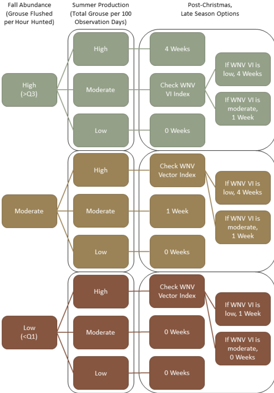
Figure 2. Responsive Harvest Framework used to develop recommendation for the length of the post-Christmas ruffed grouse hunting season in Pennsylvania.