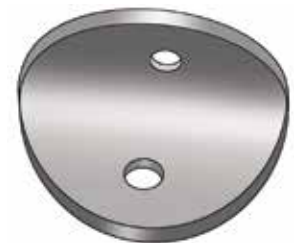
Berkshire 90-Degree Bend Washer