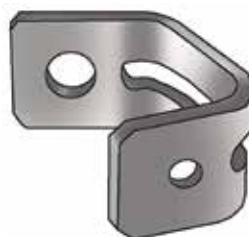
BMI Slide Free Lock