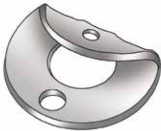
Reichart 180-Degree Reverse Bend Washer