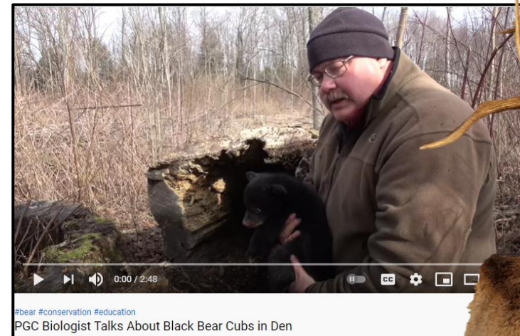
#bear #conservation #education PGC Biologist Talks About Black Bear Cubs in Den