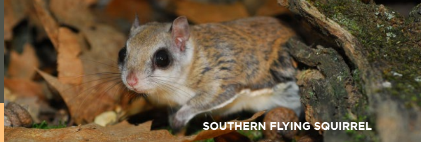
SOUTHERN FLYING SQUIRREL