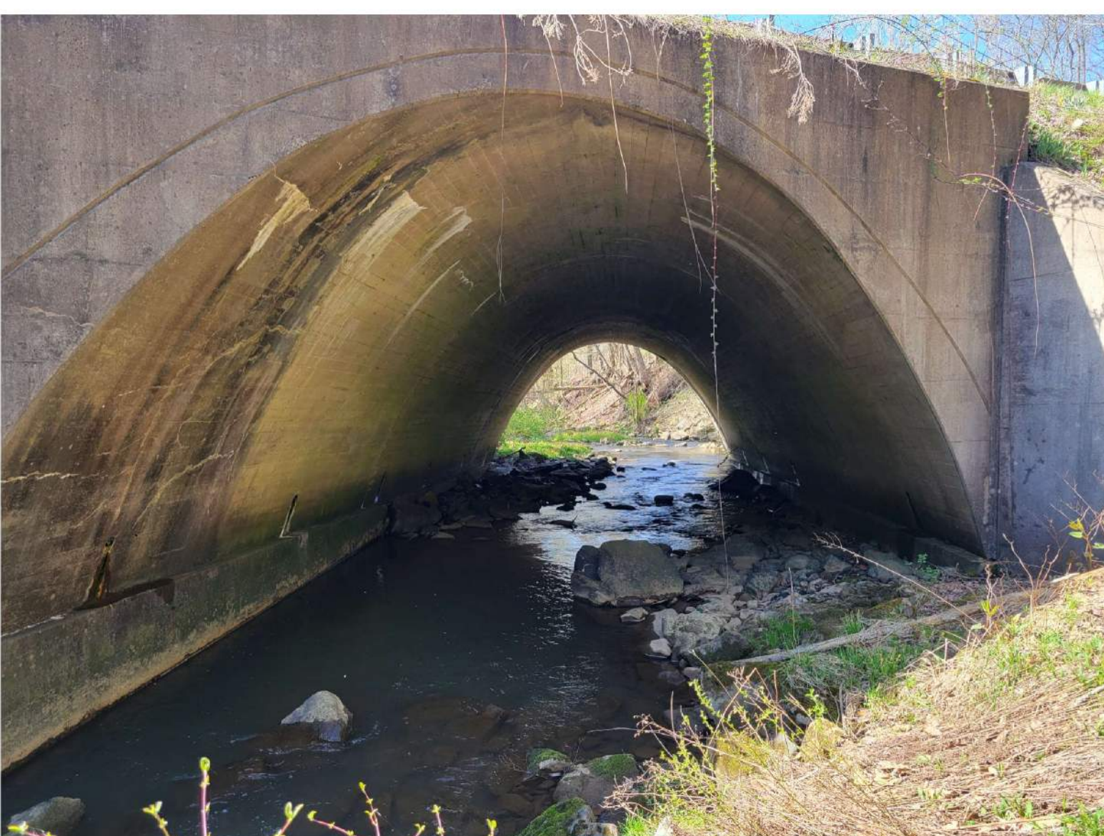
UPSTREAM LOOKING DOWNSTREAM