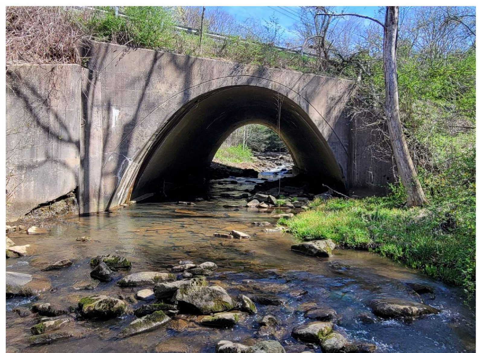
DOWNSTREAM LOOKING UPSTREAM