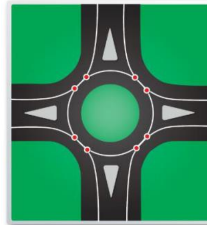
8 conflict points Roundabout