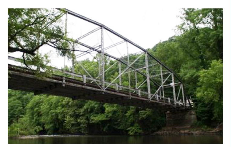
The existing historic truss will be preserved and relocated to a new location outside of Swatara State Park where it will serve as a pedestrian facility.

Both the County of Lebanon and District 8 are currently working on securing a county-owned tract of land for the new home of the rehabilitated truss. The Lebanon County and PennDOT partnership has been actively coordinating with multiple state agencies and local townships. The current proposed let date is in February 2020, and the estimated construction and rehabilitation/ relocation cost is approximately $7 million.