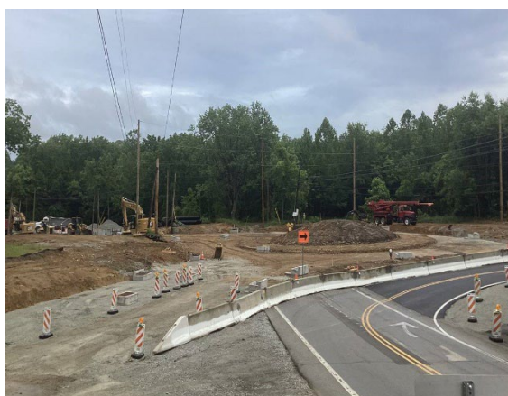
The roundabout (facing north) under construction.