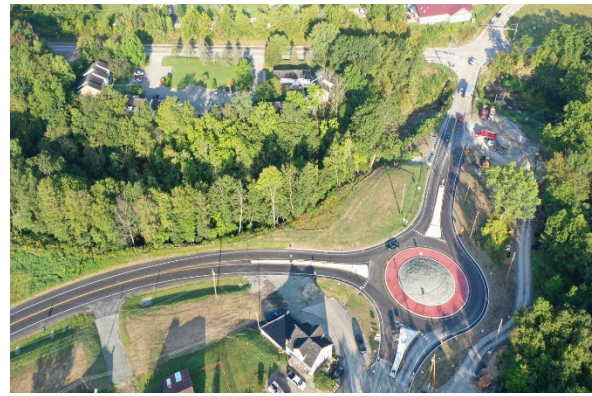
The completed roundabout at end of first construction season.

The project, as Theakston says, was more than just replacing a bridge. The main goal was to enhance the functionality of the entire corridor, making it better suited for long term sustainability. By listening to community input and working together, the deliverable will be a solution that not only improves safety and traffic operations, but benefits drivers for years to come.