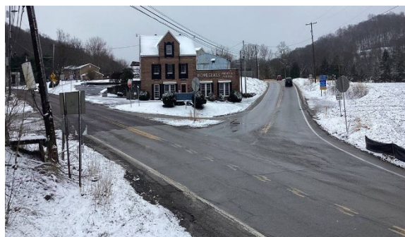
The intersection (facing south) prior to construction of the roundabout.

“Roundabouts are proven to enhance safety by slowing traffic and reducing conflict points,” Theakston said. “We knew this was the right solution, even though it increased the overall project cost.”