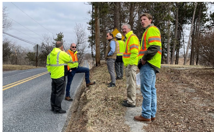
The RSA team for South Whitehall Township, Lehigh County reviewing the township planning maps in the field for Blue Barn Road in the first picture and then conducting a field review of road safety issues. The team included the township manager, planner, public works director, and chief of police. A metropolitan planner organization representative was also part of the team. The team discussed the concerns from residents and the long-term plans for this collector road. PennDOT Connects will now provide a report with short-term and long-term recommendations.