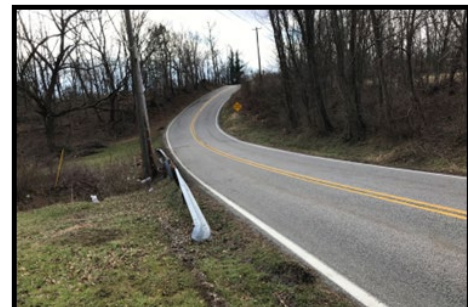
Curves are often a safety focus area for rural roadways.

Have you heard of a story similar to this one? A young couple was driving home from a school dance on a dark December night. Unfortunately, they did not make it home. They lost control of their vehicle driving on a curve and crashed into a large tree. A tragedy and two unnecessary deaths for their families and the community.