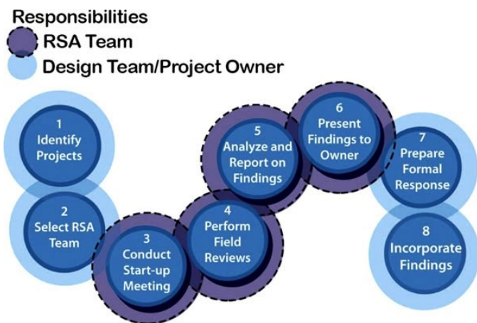
FHWA's eight step road safety audit process. Graphic: FHWA

For local roads, PennDOT Connects Municipal Outreach offers a streamlined process that can provide suggestions based on proven safety countermeasures for road user risks. In North Whitehall Township, Lehigh County, PennDOT Connects staff worked with the township and the Lehigh Valley Planning Commission to assess Clearview Road following the RSA process. The township had several concerns about the roadway, including two existing curves, speeding, and recent development growth including two senior centers. The RSA team assessed crash and traffic data, conducted a field view of the corridor, and developed safety suggestions for a variety of issues. This resulted in a safety plan for the corridor, including short-, medium- and long-term suggestions. Within a year, the township had implemented the short-term safety suggestions.