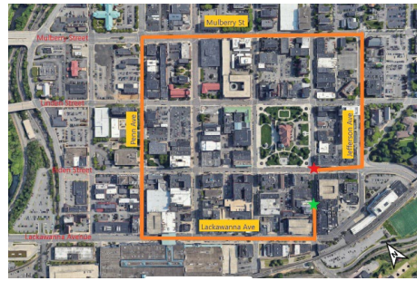
A map of the roads being reviewed during a technical assistance field visit.

PennDOT Municipal Resources helps local governments and regional/municipal planning organizations consider community needs during the planning process. Examples include: