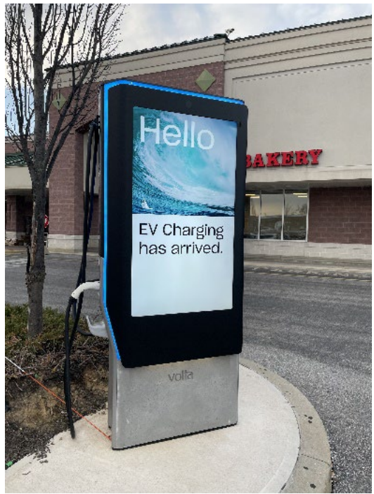
Electric vehicle charging stations are becoming more and more common throughout the commonwealth. Some are provided through state or local governments, while others are privately funded by businesses, schools, and more.

Through the Alternative Fuel Incentive Grant Program (AFIG), the Department of Environmental Protection (DEP) provides funding for municipalities toward the purchase of AFVs and innovative technologies related to those vehicles. The AFIG Program aims to reduce air emissions via the transportation sector, and each year makes roughly $5 million in grant funding available to municipalities.