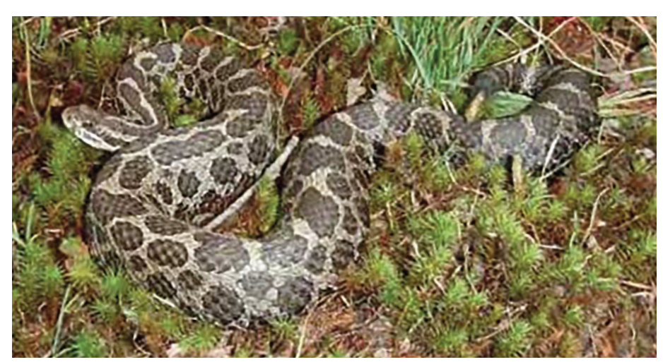
Eastern Massasuga Rattlesnakes

If an Eastern Massasauga is seen within the construction or maintenance work area, then all work activities will cease immediately. Contact the PennDOT construction manager or environmental manager immediately. It is a violation of federal and state law to harm or to possess an Eastern Massasauga. The penalties for violations of these laws include criminal prosecution and civil litigation. Permits issued are dependent upon the protection of this species and implementation of special permit conditions.