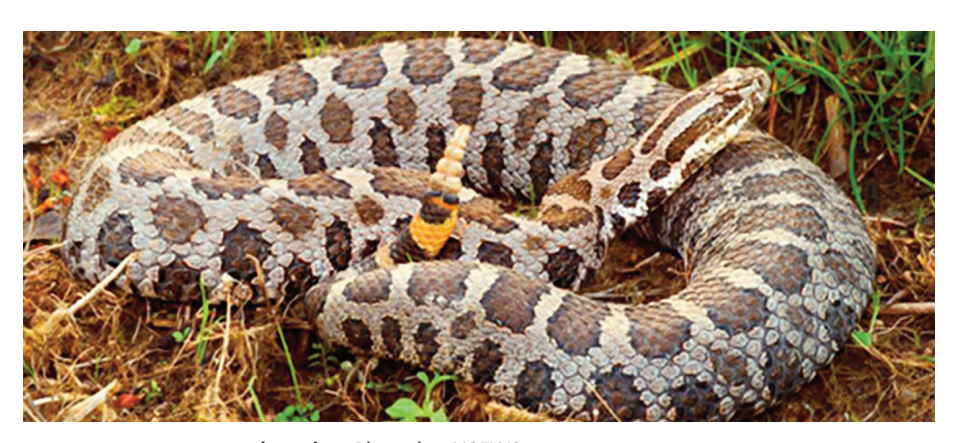
Eastern Massasuga Rattlesnake