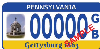
Plate Colors - Blue, white and yellow

Purchase the Pennsylvania Monuments registration plate and show your support for the cleaning, repair and restoration of Pennsylvania monuments. The registration plate pictures the Pennsylvania Memorial Monument found at the Gettysburg National Military Park and displays the words "Gettysburg 1863." Proceeds from the sale of this registration plate go directly to the Veteran Trust Fund and will be used exclusively to provide grants to nonprofit organizations for the cleaning, repair and restoration of Pennsylvania Monuments by the Gettysburg National Military Park.