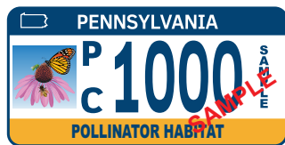
Plate Colors - Blue, white and yellow

You can own a vehicle registration plate that helps support The Pennsylvania Pollinator Habitat Plan. Historically, agriculture has been, and continues to be important to the Pennsylvania economy. Habitat loss, fragmentation and degradation, increased pesticide use and introduced diseases threaten the pollinators on which we depend for food crops and a sustainable agricultural economy. In fact the declining numbers of several species have been so significant that these species are under review for listing as federal threatened and endangered species, including the migratory Monarch Butterfly. PennDOT's Pollinator Habitat Plan will, in partnership with other federal and state agencies, private and community organizations, create naturalized gardens and meadows planted with pollinator-friendly plant species at designated sites. Sites within rest areas and welcome centers will provide additional public education benefit.