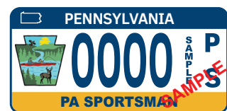
Plate Colors - Blue, white and yellow

You can own a vehicle registration plate that helps support The Pennsylvania Game Commission and the Pennsylvania Fish and Boat Commission conduct activities that promote youth hunting and fishing education.