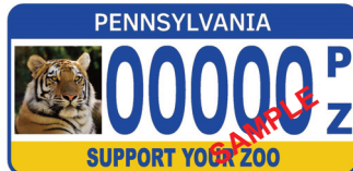
Plate Colors - Blue, white and yellow

You can own a vehicle registration plate that helps save endangered wildlife and lets you show your support for zoos wherever you drive. Created by the Zoological Council, this registration plate pictures one of the most magnificent and endangered animals in the world - the Siberian Tiger. The Pennsylvania Zoological Council is comprised of six institutions: The Philadelphia Zoo; the Pittsburgh Zoo; the Erie Zoo; the National Aviary in Pittsburgh; the Elmwood Park Zoo in Norristown; and the Lehigh Valley Zoo. Each institution is devoted to animal conservation and education programs. Proceeds from the sale of the registration plates will directly support these groups and their important projects, which include captive breeding of endangered species; creating bird sanctuaries on recovered wetlands; providing community education programs; constructing exciting interactive exhibits, and reintroducing endangered species into the wild. Purchase the zoo registration plate, and you immediately add your support to the efforts of the Pennsylvania Zoological Council. You'll also show others your love for wild animals.