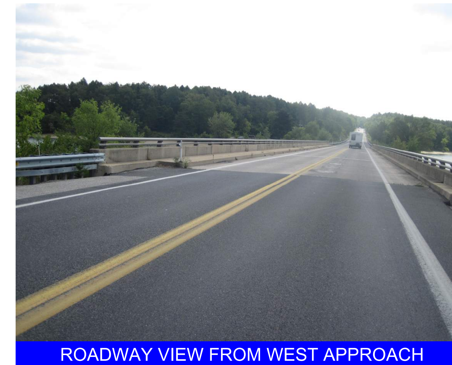
ROADWAY VIEW FROM WEST APPROACH