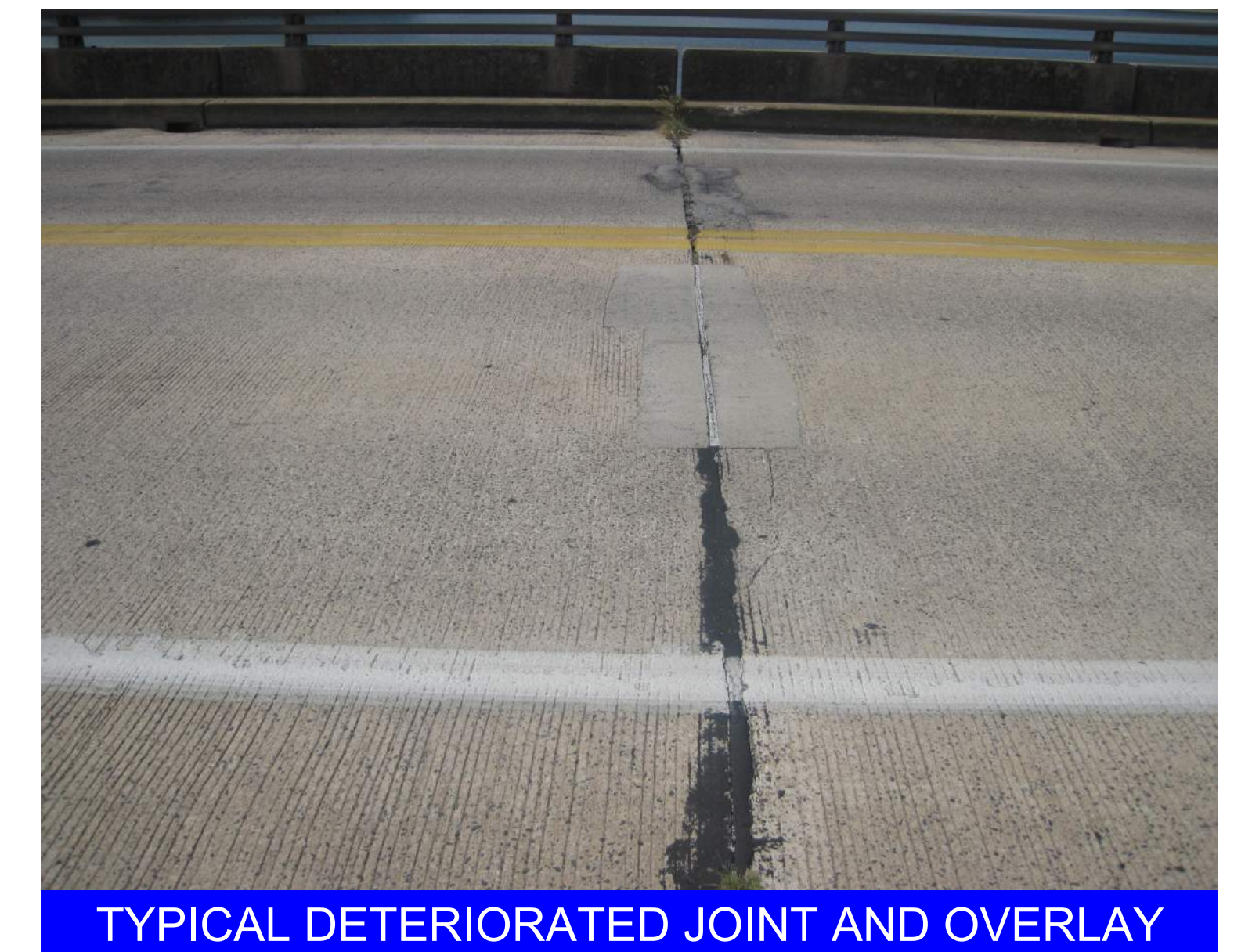
TYPICAL DETERIORATED JOINT AND OVERLAY