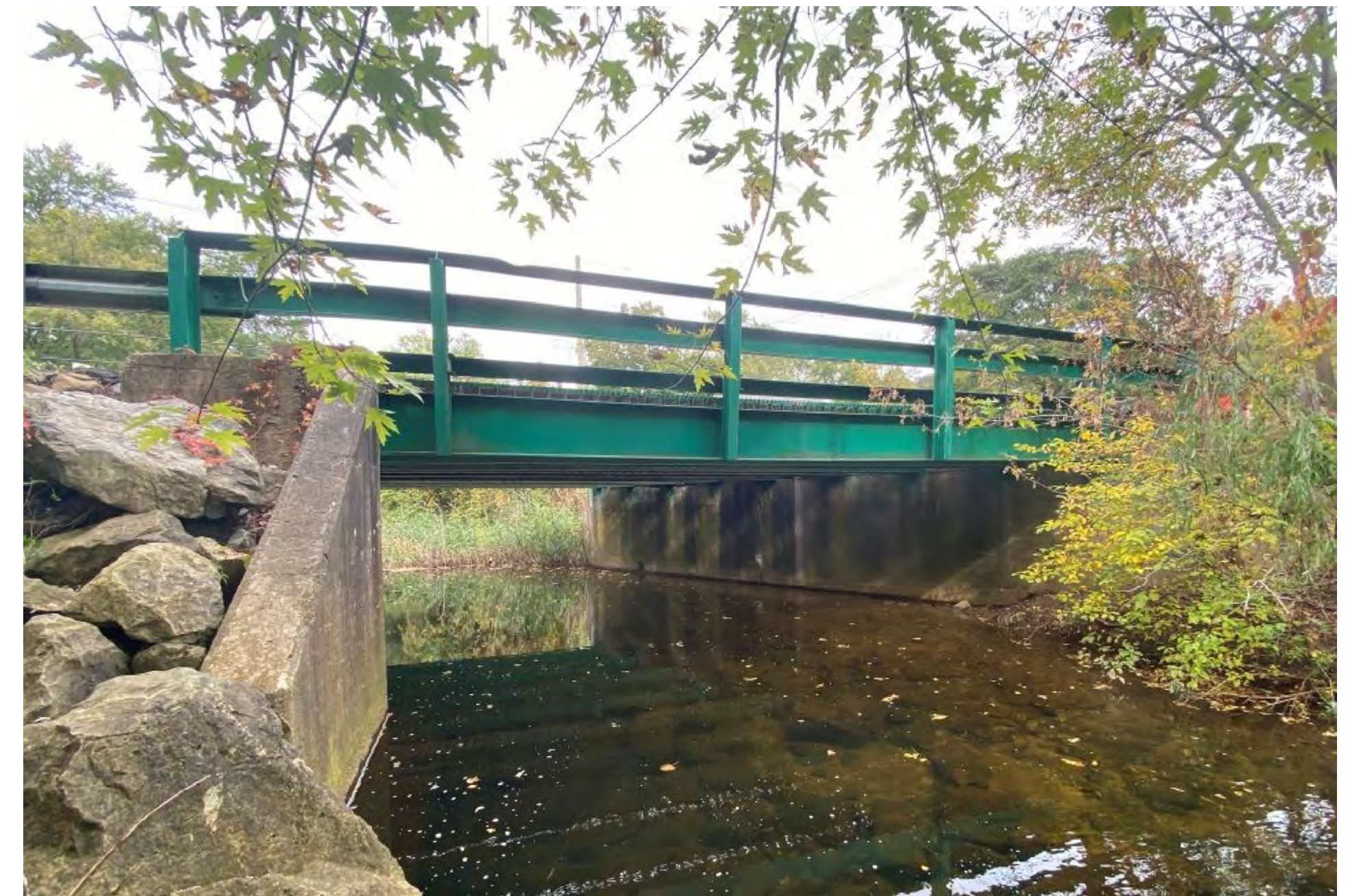
SR 2006 EXISTING BRIDGE ELEVATION NOT TO SCALE