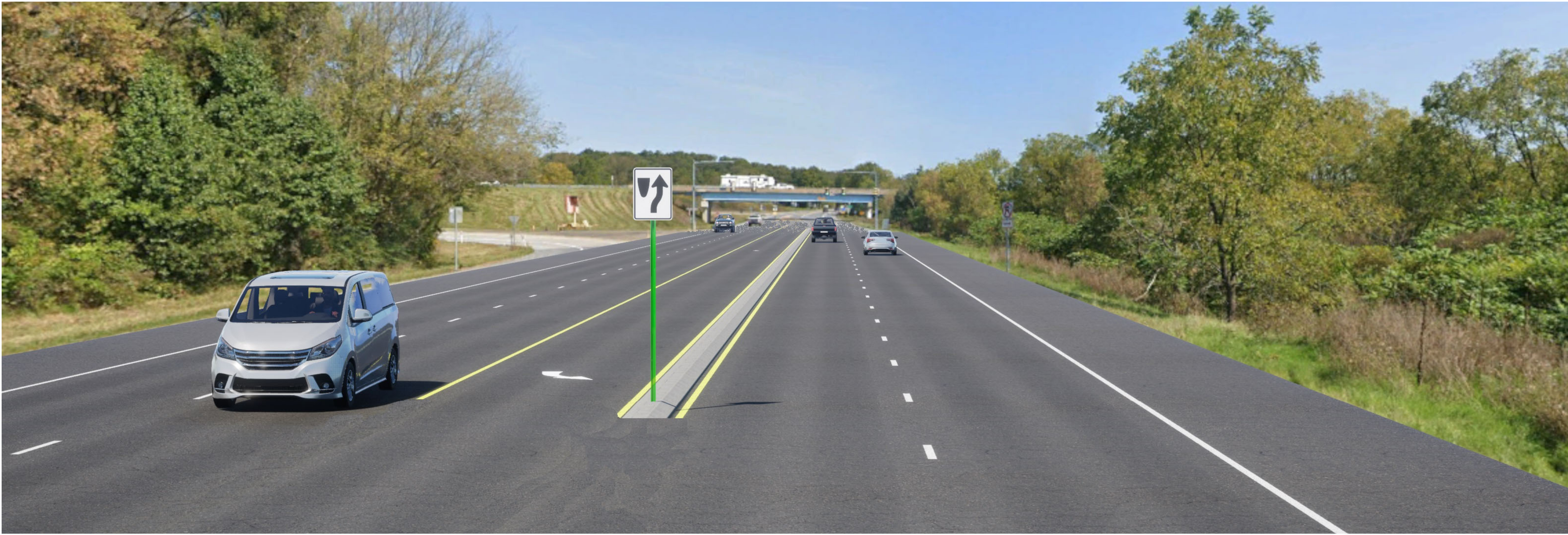
Rendering of Urban Roadway Typical Section

PA 45 in Harris Township from Boal Avenue to proposed SPUI Interchange