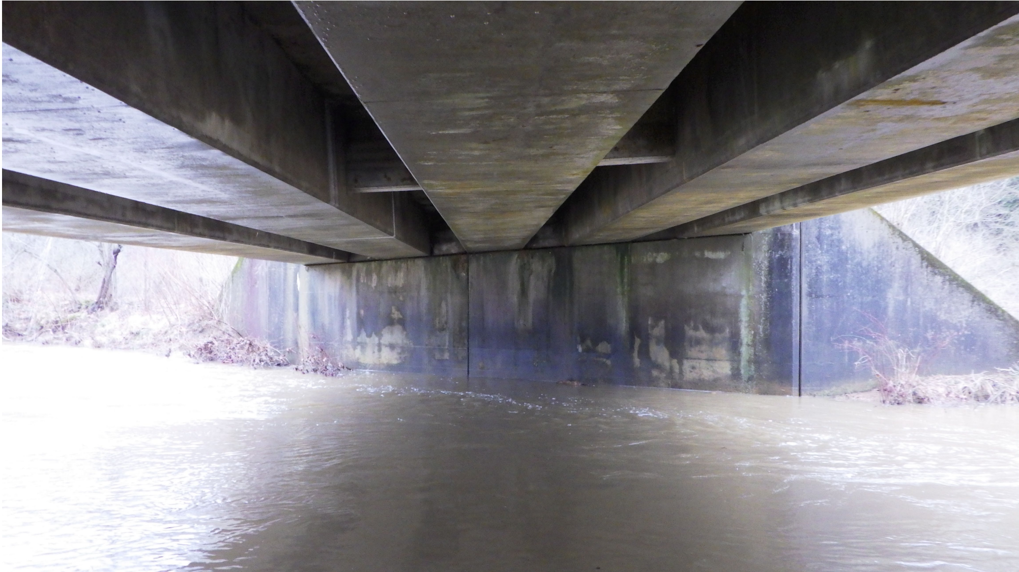
Looking South at Abutment 1