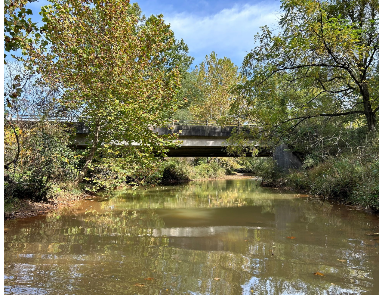
West Elevation View