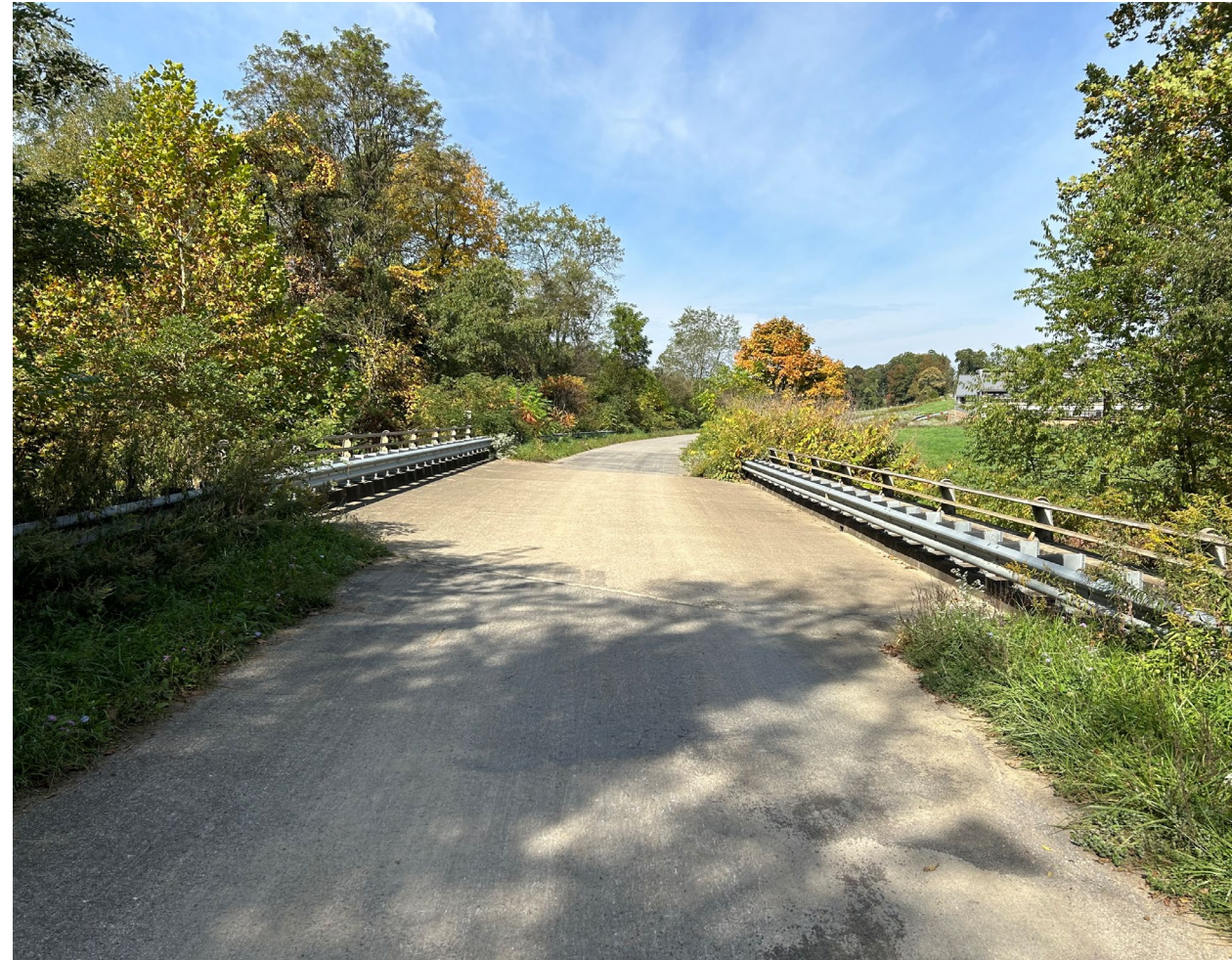
SR 3013 Looking North

Construction tentatively planned for 2026