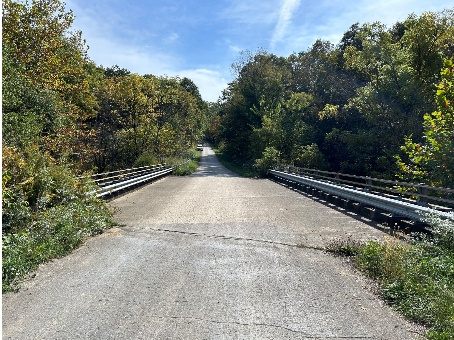
SR 3013 Looking South