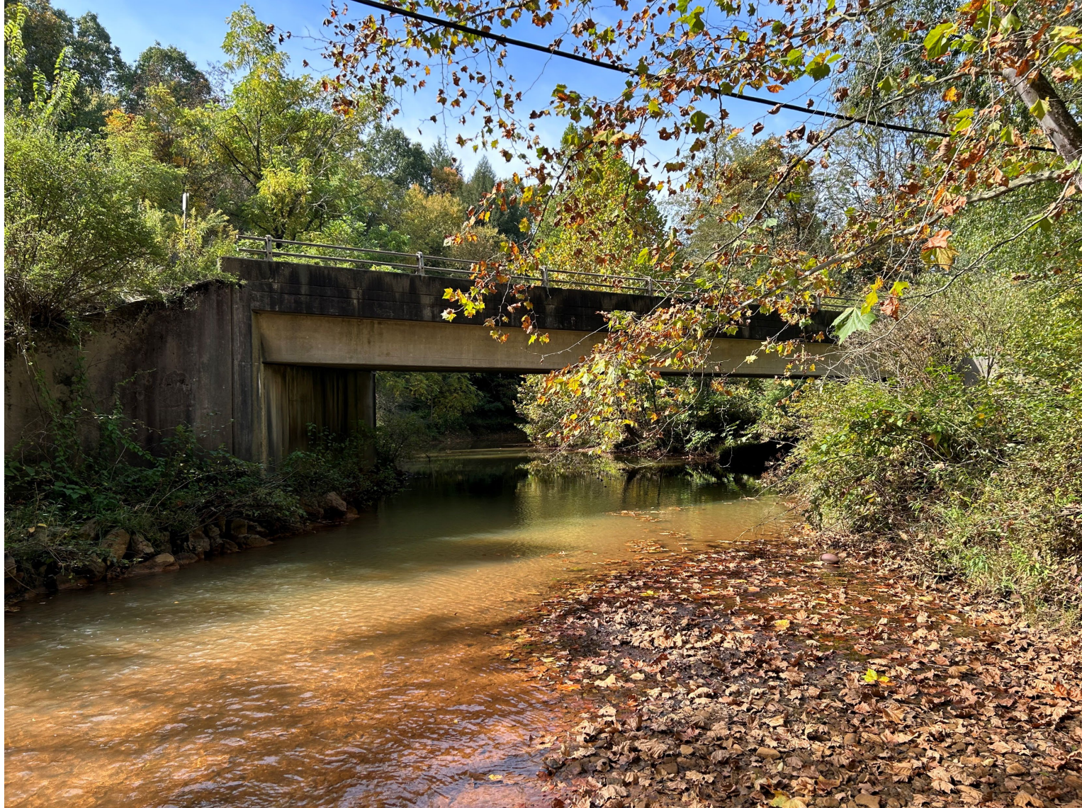
East Elevation View