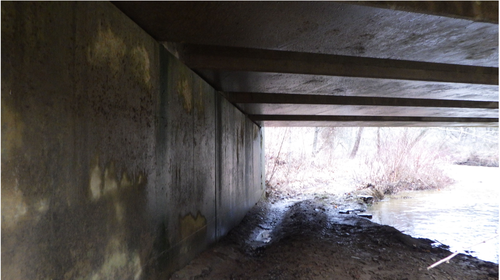
Looking East at Abutment 2