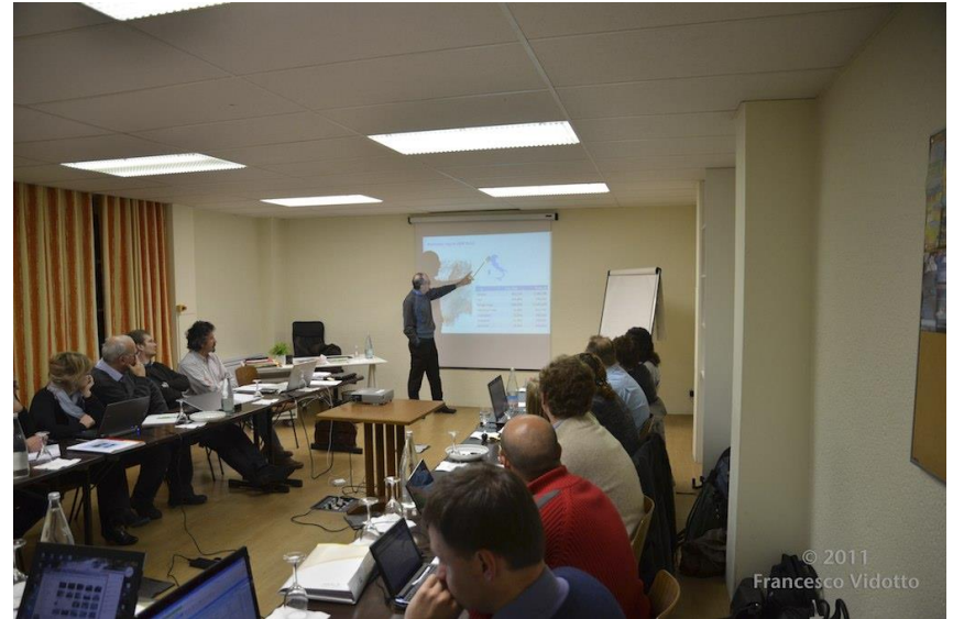
This Photo by Unknown Author is licensed under CC BY-SA-NC