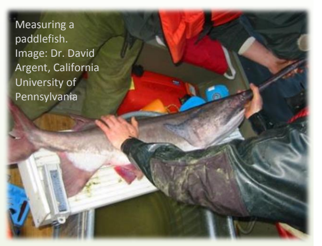
lock and dams.

determining growth, distance traveled and other important information. One Pennsylvania stocked paddlefish was found 604.5 miles downstream in Kentucky's McAlpine Dam. Another PFBC tagged Paddlefish was collected nearly 350 miles downstream from where it was stocked (Glen E. Brashears, angler, personal communication). This 10-year-old fish weighed over 20 pounds and navigated through at least 10