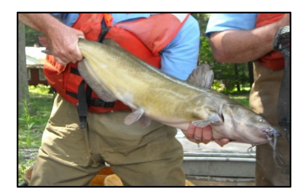
Figure 5. Adult Channel Catfish from Sweet Arrow Lake

In conclusion, the management objective to maintain and/or enhance Sweet Arrow Lake's Channel Catfish fishery through placement of catfish spawning box structures to promote natural reproduction was not realized over the duration of the study. As a result, Sweet Arrow Lake was returned to the Channel Catfish stocking program with annual plants resuming in 2021. To expedite rebuilding of the population, yearling Channel Catfish were stocked in addition to fingerlings (Table 1). Yearling Channel Catfish were included as recent evaluations have shown them to be more successful in recruiting to the population because large fish have been shown to exhibit greater survival and create higher quality fisheries sooner. In coming years, PFBC's production and management will transition to stocking larger Channel Catfish to be more efficient in population maintenance. Despite not meeting expectations, catfish spawning boxes were left in place to provide nesting habitats for Channel Catfish as broodfish numbers (Figure 5) rebuild through stocking to potentially supplement the hatchery supported fishery over time through their documented use by adults to naturally reproduce in the lake.