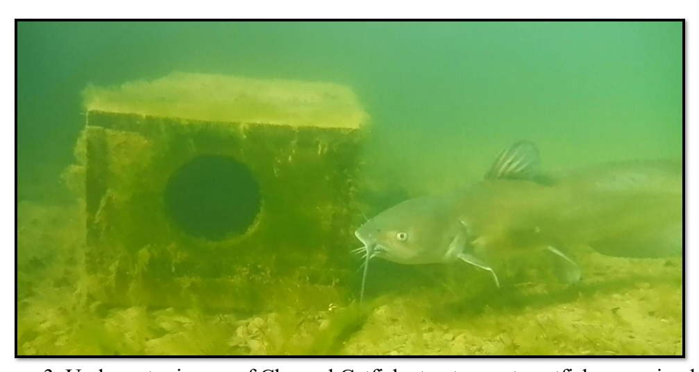
Figure 3. Underwater image of Channel Catfish at entrance to catfish spawning box

In conjunction with this study the PFBC's Lake Habitat Section surveyed Channel Catfish occupancy and/or use of spawning boxes during June when peak spawning typically occurs, and reproductively mature females seek nesting cavities to deposit their eggs that are then guarded by males. Channel Catfish occupancy of spawning boxes was highly variable, ranging from zero to 96% utilization (Table 2).