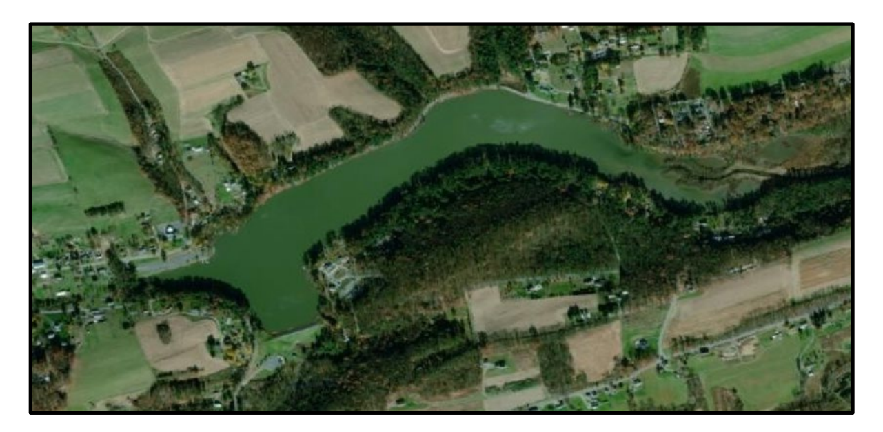
Figure 1. Sweet Arrow Lake, Schuylkill County.

Sweet Arrow Lake is located approximately one-mile northeast of the Borough of Pine Grove and is owned and operated by Schuylkill County Parks and Recreation. The impoundment supports year-round recreational angling opportunities for warmwater sportfish species and catchable trout during spring. There is one public boat launch, a mooring area, and an ADA-accessible fishing pier with ample parking; all are located off State Route 3002 (Sweet Arrow Lake Road). Only non-powered and electric motorized boats are permitted.