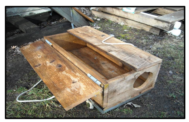
Figure 2. Catfish spawning box

to natural reproduction for this evaluation. Based on that information, we conservatively assigned any Channel Catfish 18" long and less to natural reproduction while all fish longer than 18" were credited to prior management (i.e., stocking) efforts.