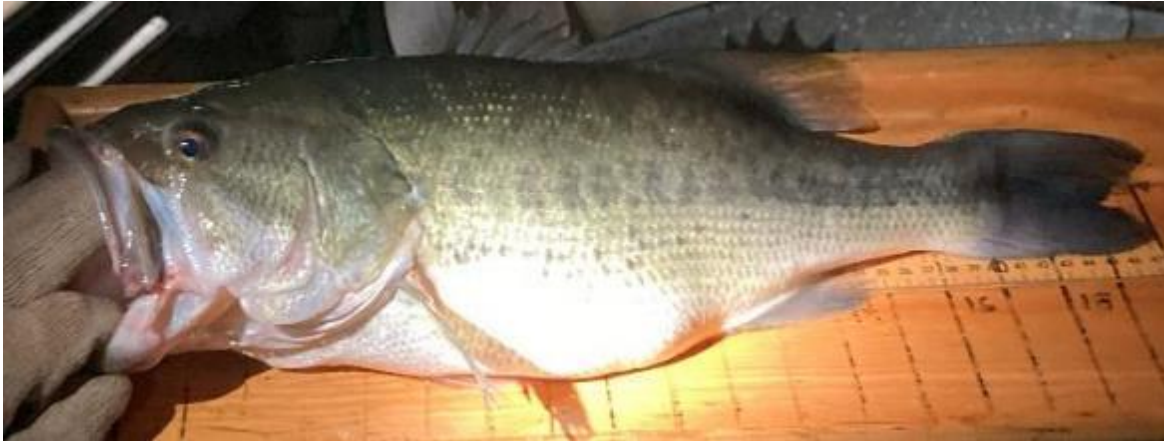
A 21.4-inch, 5.3-pound Largemouth Bass captured from Hills Creek Lake on May 6, 2025.

Hills Creek Lake is a 137-acre impoundment located in Hills Creek State Park , Tioga County. Hills Creek State Park offer many amenities including a campground and year-round programs run by the DCNR staff. The lake has several boat launches as well as a fishing pier, boat rental, and beach with swimming area. Boating is limited to unpowered boats and those with electric motors only. All fish species are undermanaged using statewide Commonwealth Inland Waters regulations.