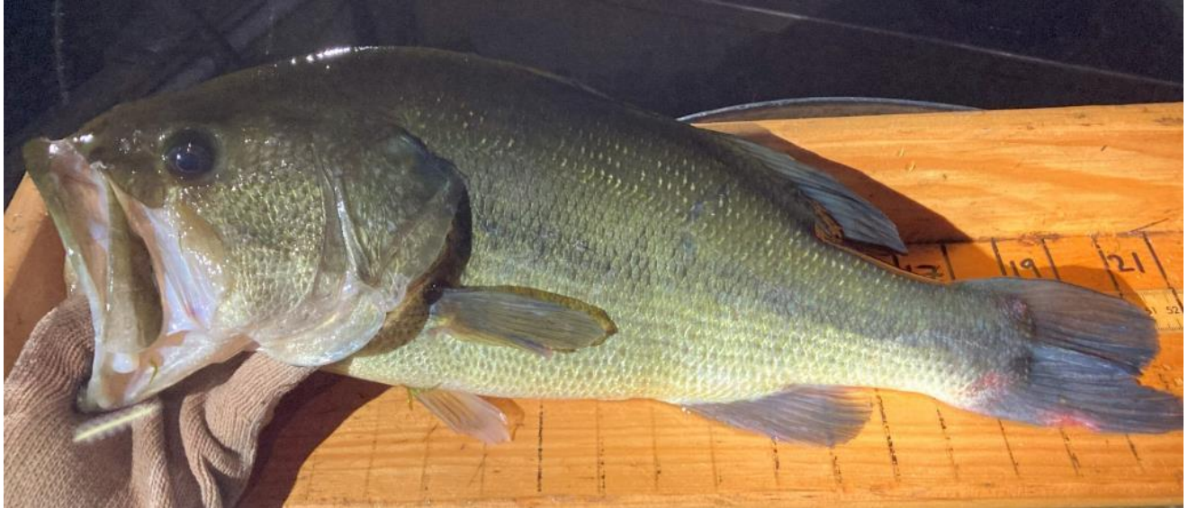
A 21.1-inch, 5.6-pound Largemouth Bass captured from Fords Lake on May 14, 2025.

Fords Lake is a 73-acre impoundment in Lackawanna County. Owned by the Pennsylvania Fish and Boat Commission, the lake has a fishing pier and boat launch with boating limited to unpowered boats and those with electric motors only. All fish species are managed using statewide Commonwealth Inland Waters regulations.