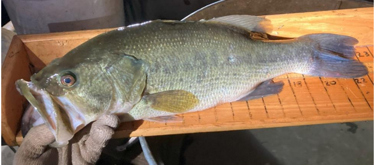
A 19-inch Largemouth Bass captured from Beechwood Lake on May 12, 2025.

Beechwood Lake is a 67-acre impoundment in Tioga County. Owned by the Pennsylvania Fish & Boat Commission, the lake has one boat launch with boating limited to unpowered boats and those using electric motors only. A map of the lake with fish habitat enhancement structures can be found here . Beechwood Lake is stocked once preseason, once in season, and once in the fall with Rainbow and golden Rainbow Trout and managed as a Stocked Trout Water Open to Year Around Fishing. All other fish species are managed under statewide Commonwealth Inland Waters regulations.