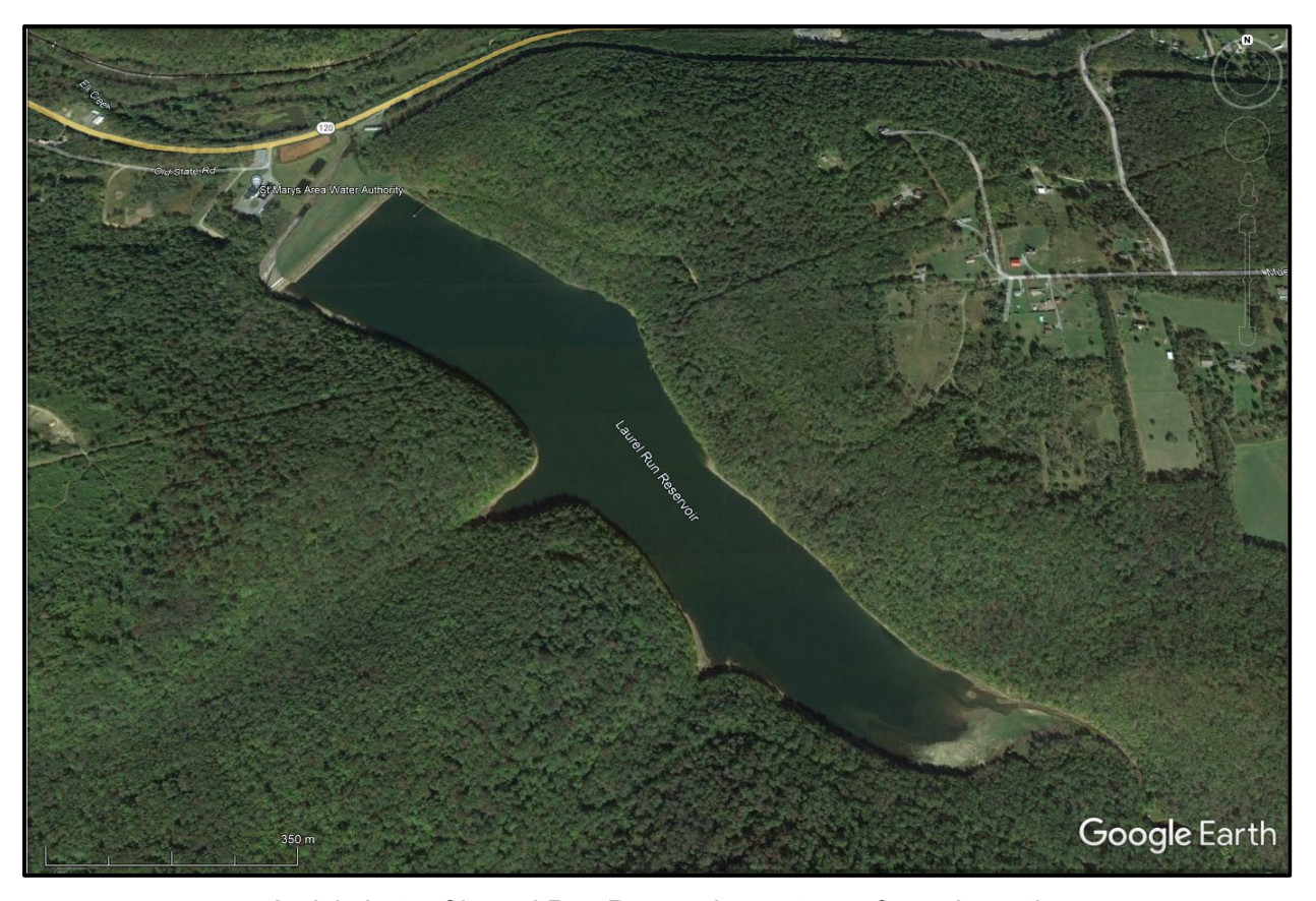
Aerial photo of Laurel Run Reservoir, courtesy of google earth.

May 2021 Night Electrofishing Black Bass Survey