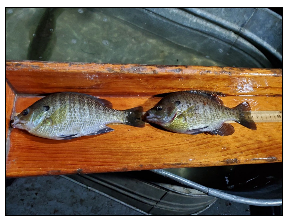
Photo 2. Nice size Bluegill observed during our night electrofishing survey at Laurel Run Reservoir.

In summary, Laurel Run Reservoir's bass population is sustained through natural reproduction and offers anglers great opportunity to capture Smallmouth Bass and Largemouth Bass. Panfish are also present in good numbers with adequate quality sized individuals, based upon our cursory observations while collecting black bass. The lake continues to provide year-round fishing opportunities for adult stocked trout.