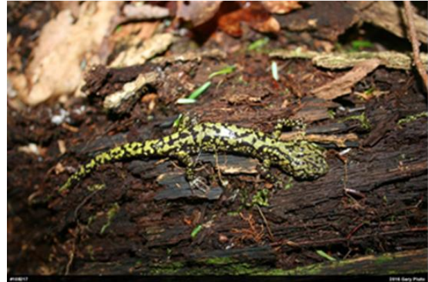
Figure 1. Green Salamander ( Aneides aeneus )

Taxonomy: Class Amphibia, Order Caudata (salamanders), Family Plethodontidae (lungless salamanders), Green Salamander ( Aneides aeneus , Cope and Packard 1881).