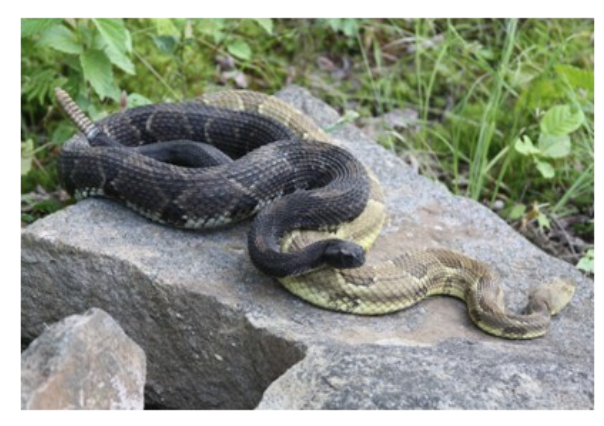
The adult color phase, either light (yellow) or dark (black), have nothing to do with the sex and is simply a genetic trait. Researchers use the head color to reference the color phase rather than the body color of the snake.