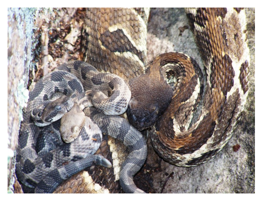
Timber rattlesnake litters are usually divided between light and dark. The dark coloration is more common in northern Pennsylvania.