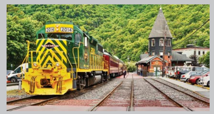
Lehigh Gorge Scenic Railway in Jim Thorpe, Carbon County

The lake and surrounding areas host several summer celebrations including Wally Lake Fest, Hawley Independence Day Celebration and Pocono Dragon Boat Race.