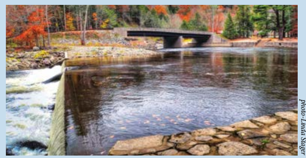
Worlds End State Park, Sullivan County

Regional designations are based on Pennsylvania Fish and Boat Commission Law Enforcement regions.