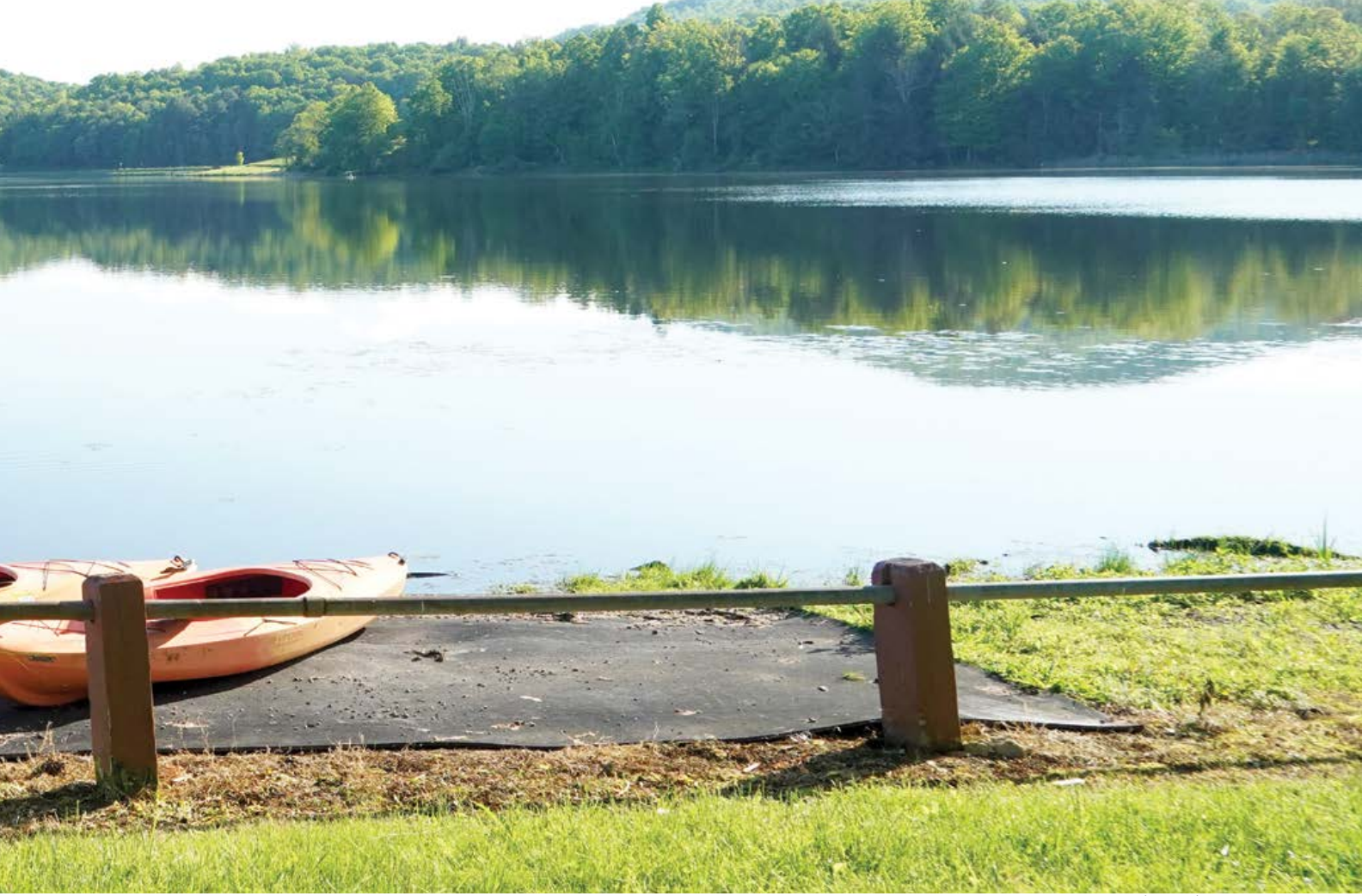
Mount Pisgah State Park, Bradford County