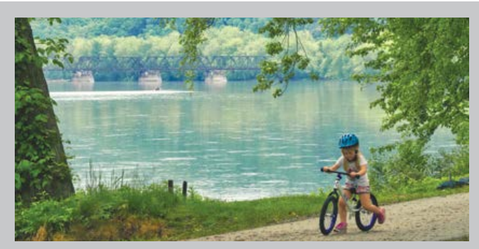
Bloomsburg, Columbia County