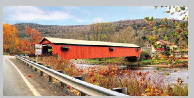
Forksville Covered Bridge, Sullivan County