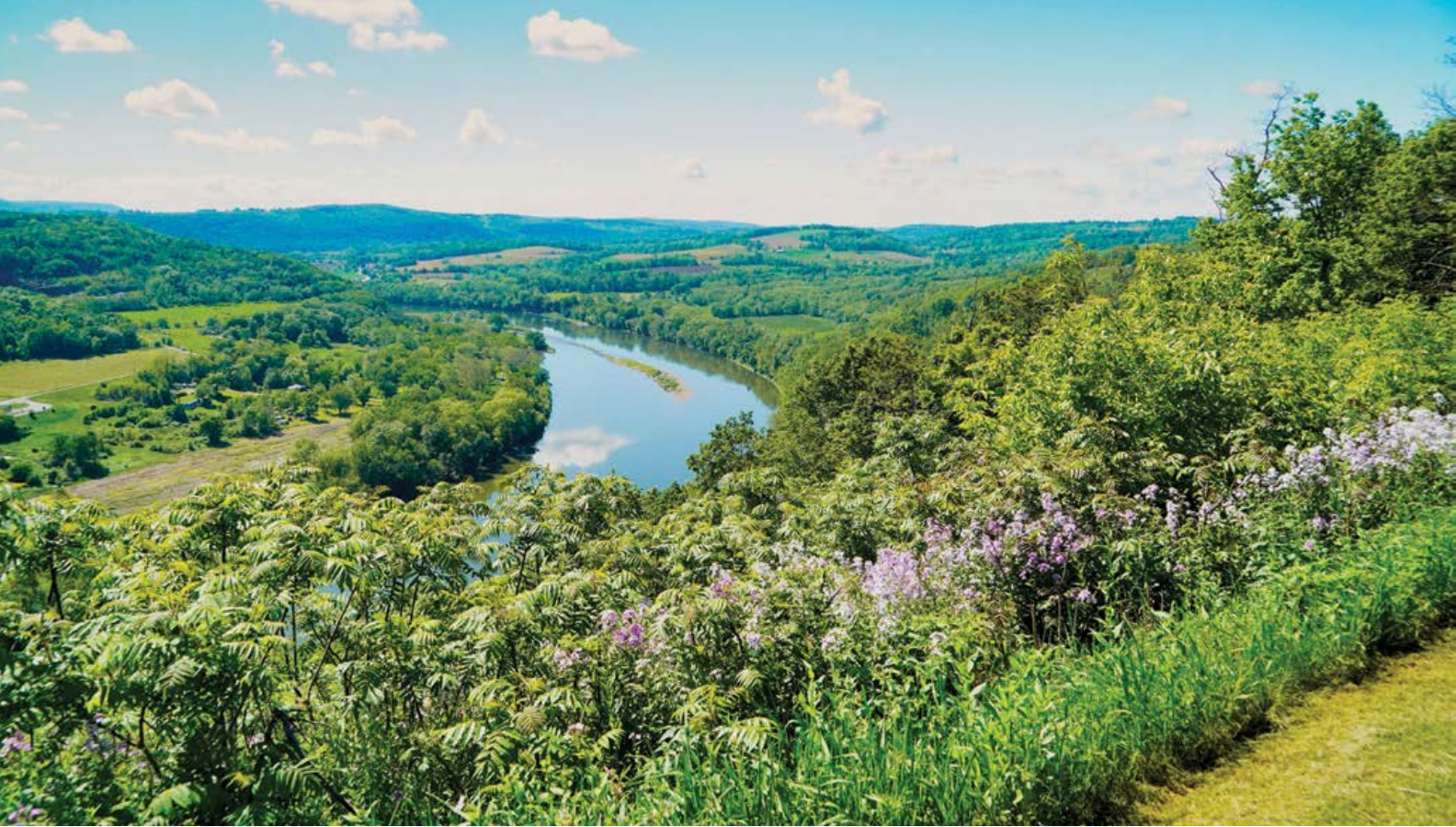
Endless Mountains, Bradford County