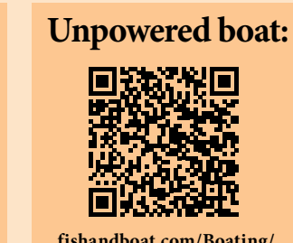
fishandboat.com/Boating/ Register-Title-Boat/Pages/ Unpowered-Boats.aspx