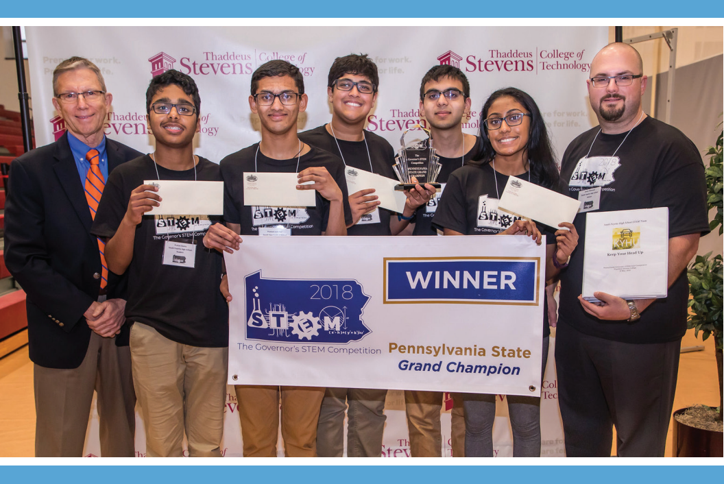
2018 Grand Champions – the South Fayette High School STEM team

The following text is part of a display at Rock Lititz. The Governor's STEM Competition students toured the facility in May 2018: