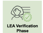
The Roster Verification Phases