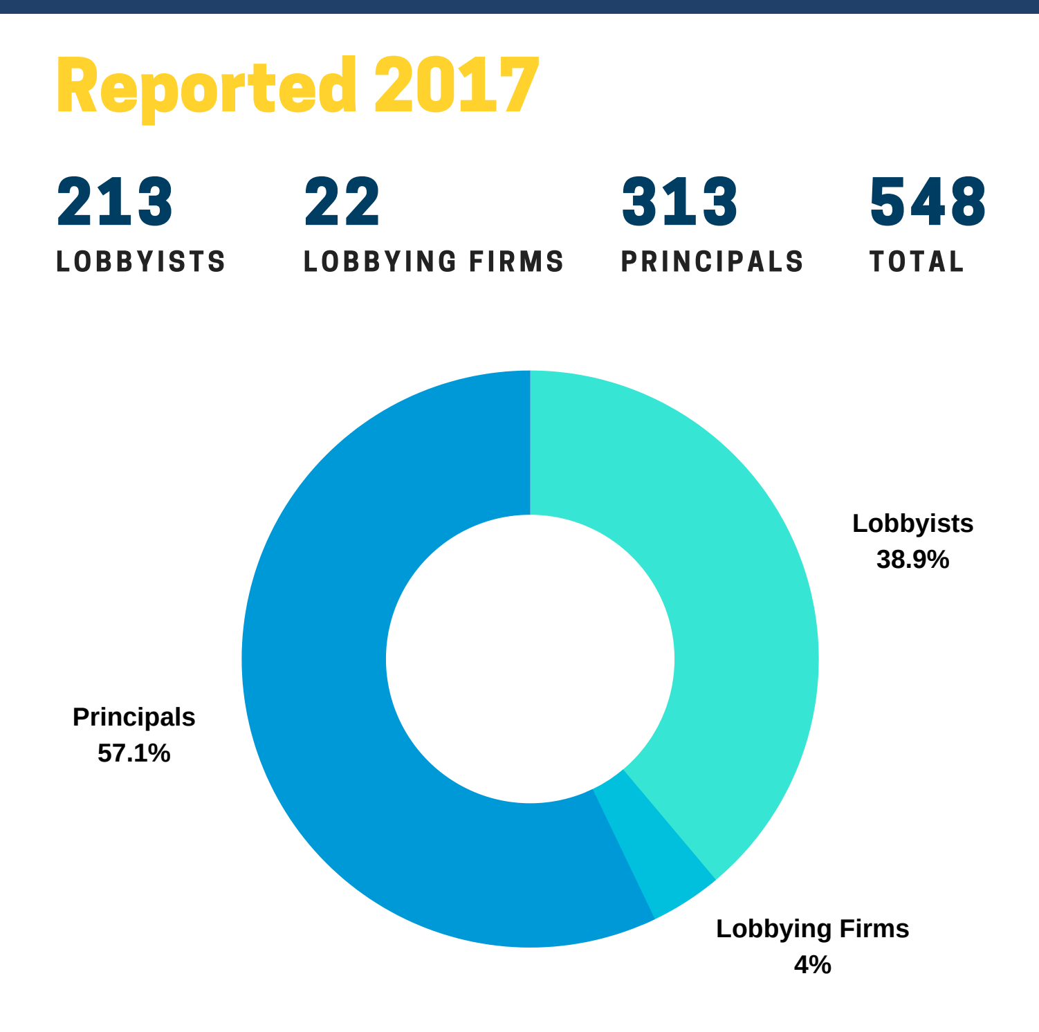
Figure 1: Percentage of registered lobbyists, lobbying firms, and principals in 2017