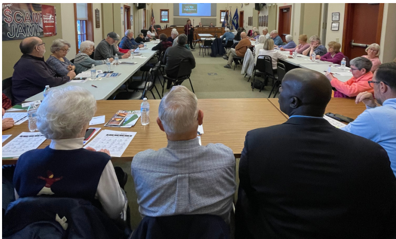
Photo from our Feb. 7, 2024, $camJam event in Lower Allen Township

Do you want to bring investor education to your organization? Contact us today at informed@pa.gov to schedule a consumer outreach event in your area.