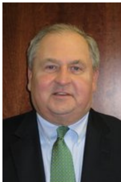
James R. Biery Chair