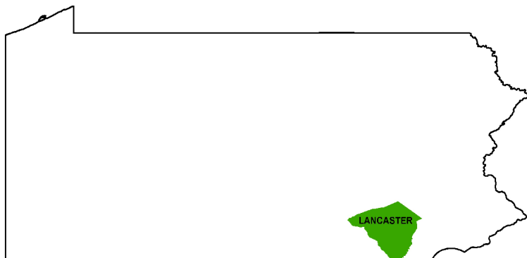
Workforce Development Area (WDA) Unemployment, Jan 2014 to Jun 2024