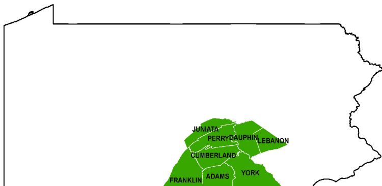
Workforce Development Area (WDA) Unemployment, Jan 2014 to Dec 2024