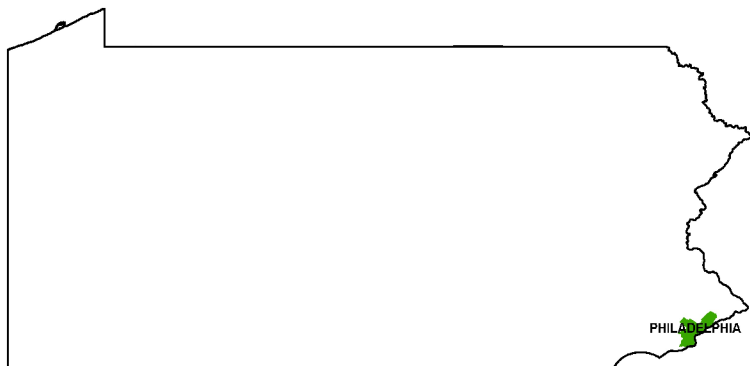
Workforce Development Area (WDA) Unemployment, Jan 2014 to Dec 2024