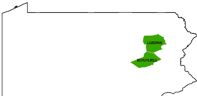
Workforce Development Area (WDA) Unemployment, Jan 2014 to Dec 2024