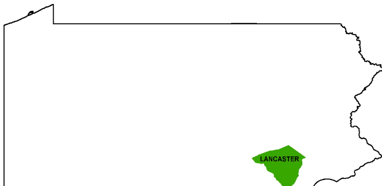
Workforce Development Area (WDA) Unemployment, Jan 2014 to Dec 2024