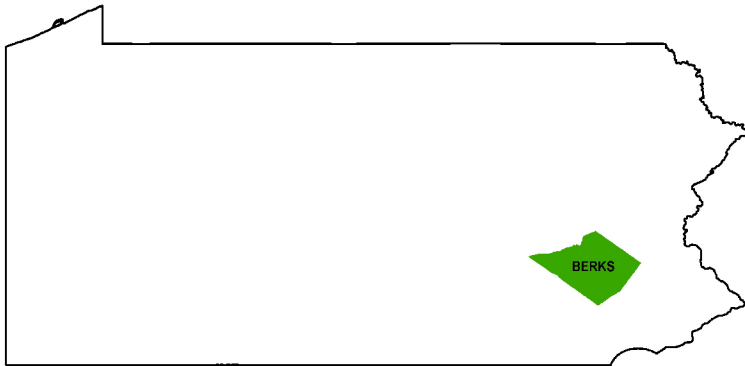
Workforce Development Area (WDA) Unemployment, Jan 2014 to Dec 2024