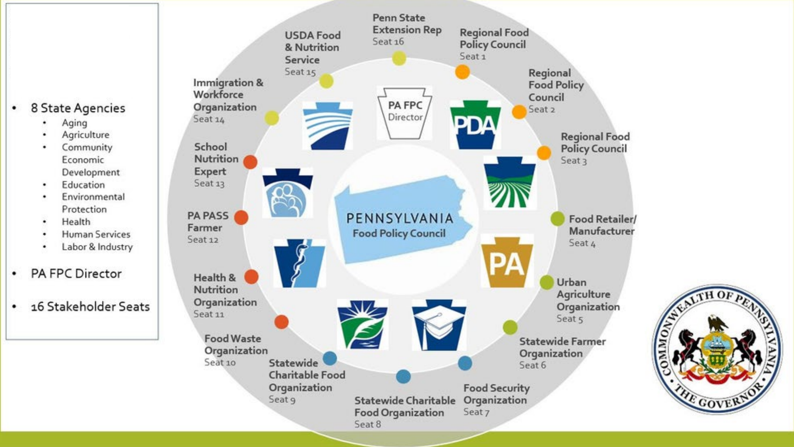
Figure 1. Organizational Structure of the PA Food Policy Council as established in EO 2022