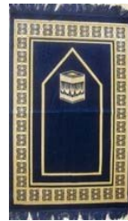
Item 0380 Navy Blue

27" x 48" (Below). 80% Cotton / 20% Acrylic. Patterns will vary Price: $10.00 each